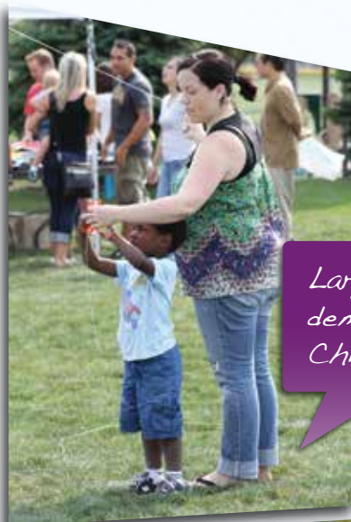
Large and stunt kite demonstrations by Chicago Kite!